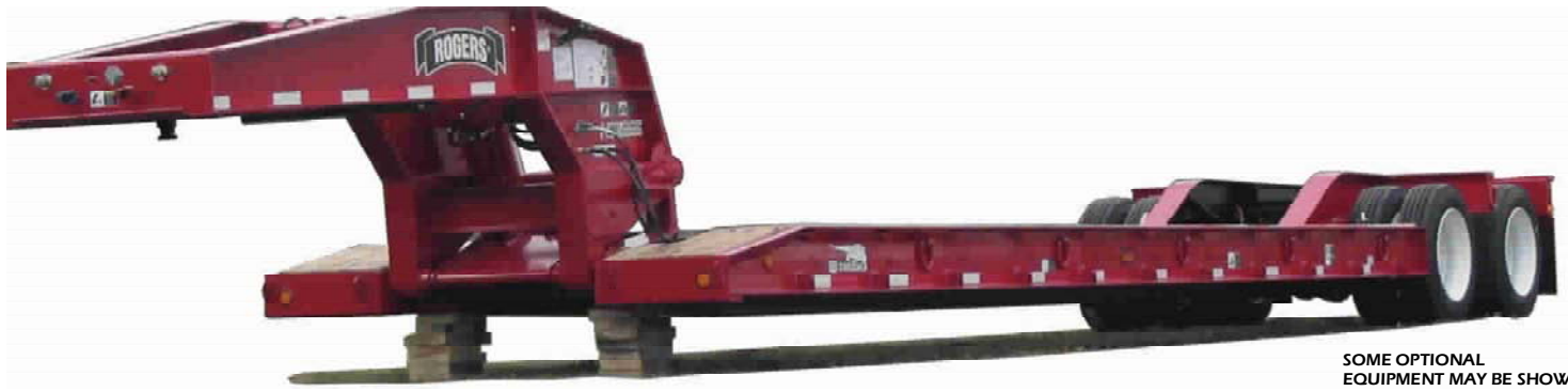
SOME OPTIONAL EQUIPMENT MAY BE SHOWN.

ROGERS® presents our 35-ton capacity detachable gooseneck Century Series trailer - Model CY35PL. Each Rogers CY35 trailer is manufactured with the superior quality standards that provide the longest life cycle in the industry. Rogers brings simple, economical, trouble-free operation to your hauling requirements.