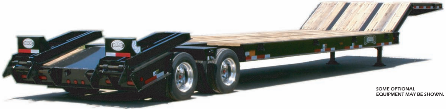
SOME OPTIONAL EQUIPMENT MAY BE SHOWN.

The ROGERS® FIXED GOOSENECK MH25 – a "carry all" trailer with the combined conveniences of a rear loading style, a spacious level deck, and sloped access to the full-width gooseneck. It is a gooseneck style that can hold machine equipment or a cargo load. This 25-ton Machinery Hauler has the streamline dependability to provide trouble-free service.