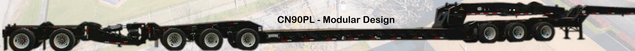
CN90PL - Modular Design