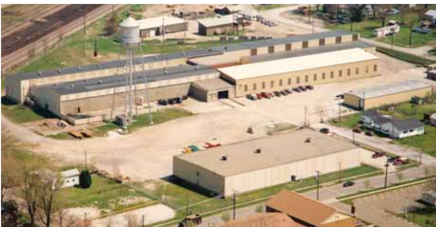
Factory Space: 100,000 sq. ft. (9,290 sq. m.)