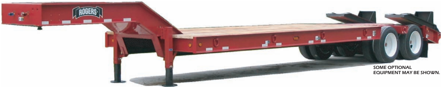
SOME OPTIONAL EQUIPMENT MAY BE SHOWN.

The ROGERS® FIXED GOOSENECK TVT35 – streamline dependability in a 35-ton capacity trailer. It features the convenience of a rear loading style with a spacious level deck. The long, flat fixed gooseneck easily accommodates equipment buckets and blades. This trailer will provide reliable, trouble-free service.