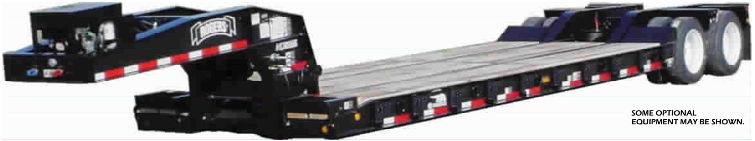
SOME OPTIONAL EQUIPMENT MAY BE SHOWN.

The ROGERS® CR35PL 35-ton capacity detachable gooseneck is packed with features to make your job easier and safer. Each CR35PL is manufactured to superior quality standards that provide the longest life cycle in the industry. The CR35PL is simple, economical, and trouble-free.